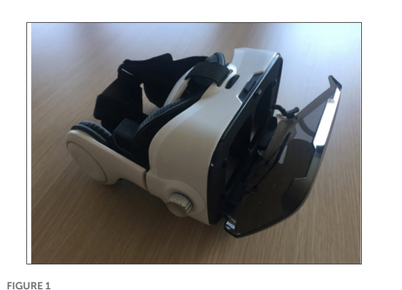
Head-mounted display for smartphone used for viewing 360° video.

Video viewed in HMD with smartphones (duration 4 min 55 s) presented video images to participants that were recorded at different depths and offered them the possibility to discover and see the aquatic environment in which they were going to swim (without swimmers present to help them to familiarize with underwater conditions without other information to take account) (Figure 2).