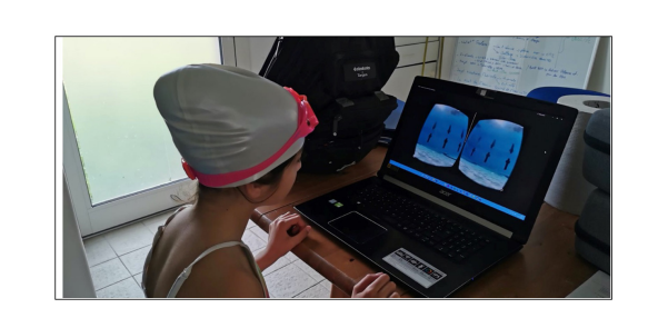
FIGURE 4 Self-confrontation with swimmer during lap-top viewing.

inspired by Peirce's semeiotic (Skagestad, 2004). The courseof-experience framework is based on the notion of tetradic sign (Theureau, 2004). The tetradic sign is a triad that linked object-representamen-interpretant subjacent to the course of the experience unit. Poizat et al. (2022) defined the object like referred to the actor's involvement in the situation, the representamen refers to perceptive, proprioceptive, or mnemonic judgment, and the interpretant refers to the activated (or established) knowledge that allows the actor to interpret the situation (Table 1). The course of experience unit refers