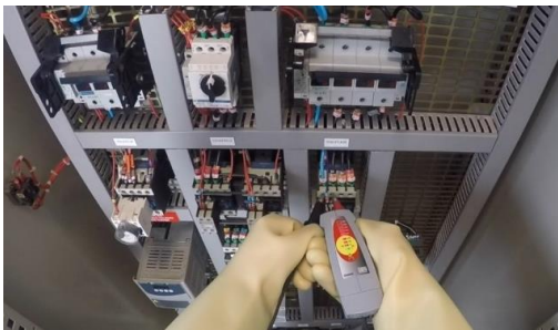
Figure 4 : Image extracted from a video explaining the voltage measurement process

Finally, to illustrate the complex technical gestures, difficult to represent in the virtual environment, because demanding in terms of calculation capabilities, videos are accessible in the form of help in the virtual environment. These videos were shot with immersive cameras to illustrate as accurately as possible the technical actions to be performed, as shown in Figure 4 in a troubleshooting procedure. The final step, which is still partially in process, is the encoding of the scenarios algorithm by the partner