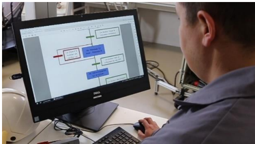
Figure 3 : Programming of intervention scenarios

In order to have a common language between the “electrical engineering team” and the “virtual reality team”, the scenarios description was developed in Grafacet (graphic programming, easily interpretable by all). For the virtual experience to be realistic, it was essential to give the learner the opportunity to make mistakes up to virtual electrification, simulated by a vibration. Three configurations are the possible (Figure 3): (a) the operations are performed correctly, (b) some errors require to stop the current action and to start it again (the troubleshooter does not intervene on the right element for example) and (c) the errors don't have an immediate consequence, but will cause an accident in the long term (the operator has incorrectly assessed the risk, or poorly chooses its protective equipment). In case of false manipulation, a vibration of the joysticks and a flash light simulates the electric shock.