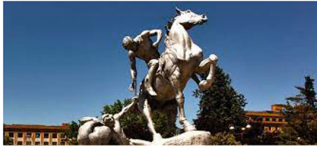
Fig. 3. University Complutense of Madrid, campus. Spain.