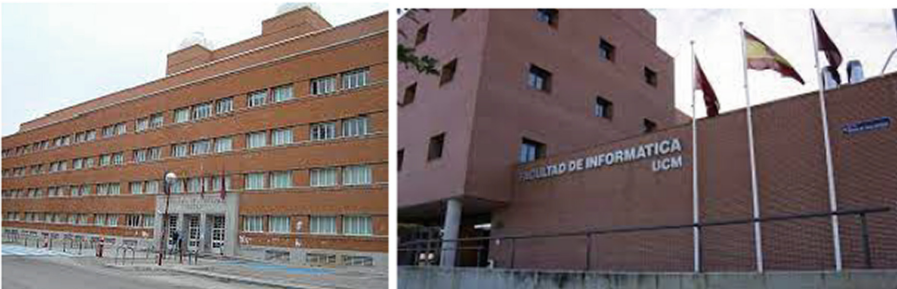
Fig. 4. Physics (left) and computer sciences (right) faculties.

The host institution was also interested because this way it will count on students with a suitable background to contribute to the research that was going on at different