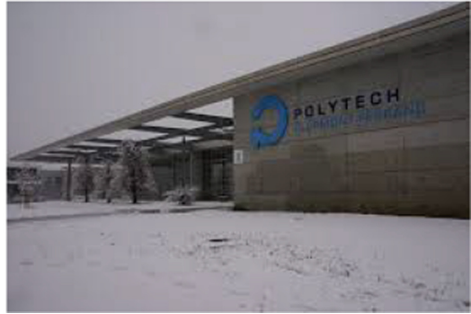
Fig. 1. Polytech Clermont (France).