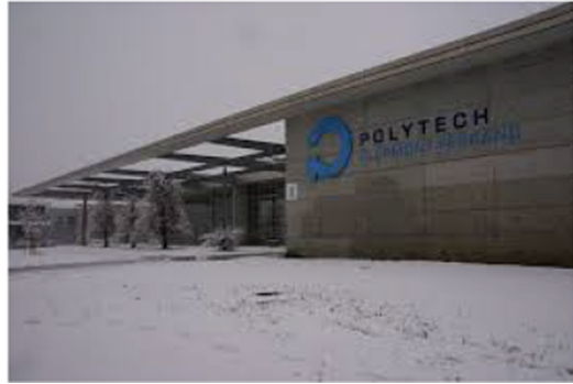
Fig. 1. Polytech Clermont (France).