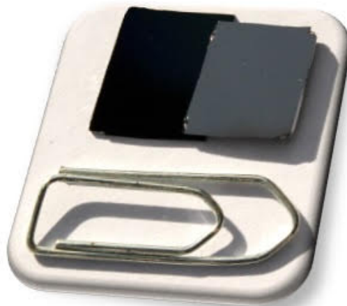
Antireflective coating. Right: silicium. Left: silicium + antireflective coating. AI-designed AR coating typically reduce the part of light which is lost. (collaboration Univ. Clermont-Ferrand)

Madagascar has 75% of its population without any access to electricity and even the rest of the population. We collaborate with Univ. Antananarivo for modeling the key “what if” questions regarding the electrification of Madagascar. Other models for electricity are under development. We include problems close to waveguides .