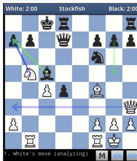
Stockfish used Nevergrad and still wins top competitions in spite of the zero-learning era (Wikipedia).

Nevergrad is used for tuning StockFish, a very strong chess program still winning top competitions in spite of the zero-style programs . Nevergrad's has been used for optimizing the weights of the neural value function .