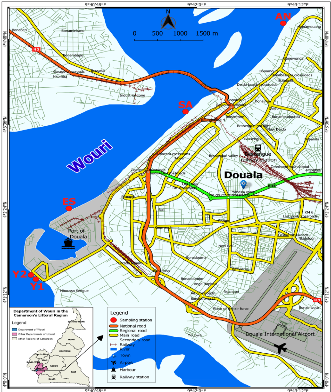
Figure 1. Map of the study area showing sampling stations

isolated. The Kruskal – Wallis test and Mann – Whitney test were then performed with SPSS 25.0 to verify significant differences between stations considering each environmental parameter. The Principal Component Analysis made it possible to characterize the areas sampled in the landing stages on the basis of the distribution of the concentration of bacteria in relation to the physico-chemical parameters of the water. The objective of this descriptive analysis method is to present in graphic form the maximum amount of information contained in a large data table [17].