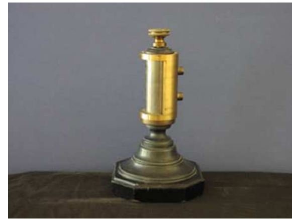
Figure 1: Revolute or Pin Kinematic Pair.

To go back to our example of the rotating body, it is the contact between the rigid axis and the rigid wheel which makes it the case that the latent force will counterbalance any external “disturbing” one. The wheel and the axis are related by what Reuleaux