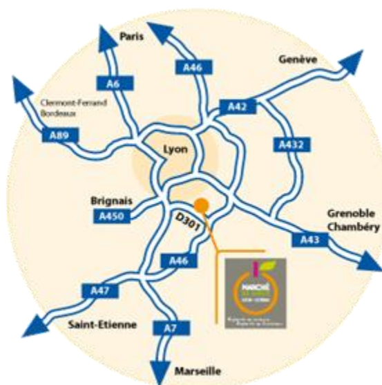
Figure 3 - Location of the wholesale market of Lyon-Corbas