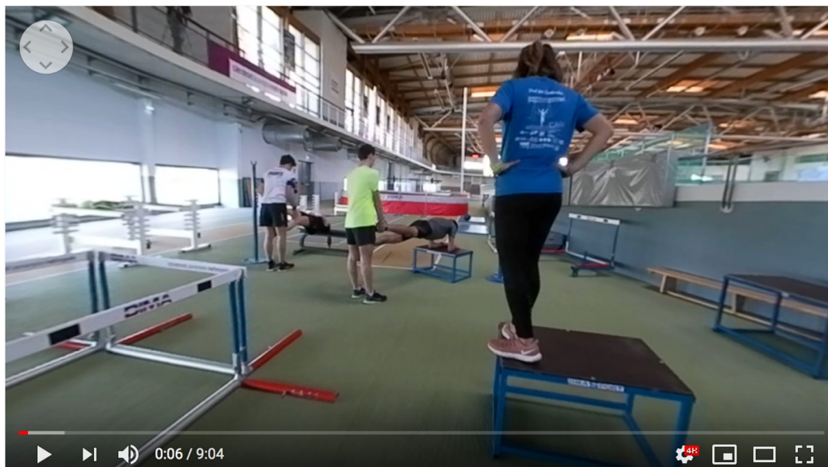
Figure 1: 360° video issued from Form@tion360 platform (Roche, 2020)