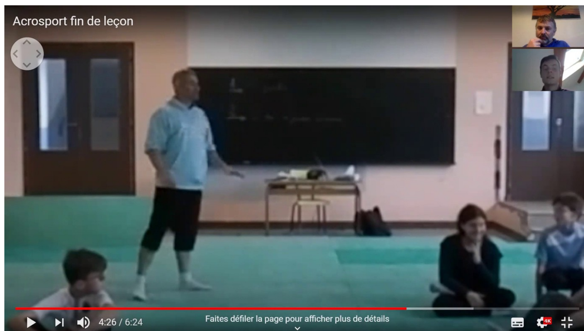
Figure 2 : Self-confrontation interview with one pre-service teacher

describe their concerns ("What are you trying to do at that moment ?"), perceptions ("What do you pay attention to ? What do you notice ?"), emotions ("What do you feel ?") and knowledges used ("What are you thinking about at that moment, what do you tell yourself ?").