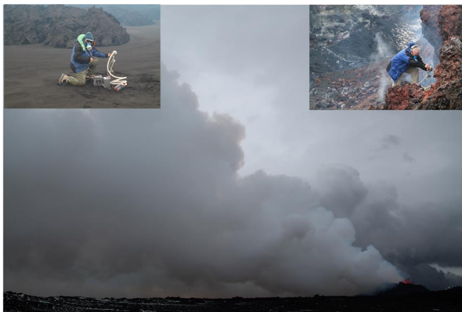
555 Fig. 1 Grounded gas plume at Holuhraun on 2 October 2014 caused by atmospheric 556 temperature inversion. Top left and right insets show, respectively, sampling conditions 557 within the syn-eruptive gas plume and of the post-eruptive gas phase inside the eruptive 558 fissure on 9 March 2015. 559