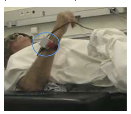
Figure 1: The plastic case containing the accelerometer tied to the patient's wrist.

We have recorded acceleration data from 6 bilateral DBS implantations for PD (n=2) and ET (n=4), under an ongoing clinical study at the University Hospital Clermont-Ferrand, France. A 3-axis accelerometer is placed inside an in-house developed plastic case and tied to the patient's wrist (Fig. 1) to measure its acceleration during test stimulations. Acceleration data is recorded at all the test stimulation positions on all the planned trajectories. The acceleration recording is performed by connecting the accelerometer via a USB cable to a laptop using in-house developed application. The acceleration recording is started earlier than the test stimulation and continues while the stimulation amplitude is varied (Fig 2). No specific instructions are given to the neurosurgeon or the patient for the posture of the arm or movements. The data is recorded while the neurosurgeon performs his routine evaluation. The data recorded without any test stimulation is used as a baseline for comparison with data recorded during the test stimulation. The amplitudes of stimulation at which an effect is visually observed on the symptoms (subjective threshold) and at which side-effects occur (side-effect threshold) are noted in the software.