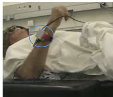
Figure 1: The plastic case containing the accelerometer tied to the patient's wrist.

We have recorded acceleration data from 6 bilateral DBS implantations for PD (n=2) and ET (n=4), under an ongoing clinical study at the University Hospital Clermont-Ferrand, France. A 3-axis accelerometer is placed inside an in-house developed plastic case and tied to the patient's wrist (Fig. 1) to measure its acceleration during test stimulations. Acceleration data is recorded at all the test stimulation positions on all the planned trajectories. The acceleration recording is performed by connecting the accelerometer via a USB cable to a laptop using in-house developed application. The acceleration recording is started earlier than the test stimulation and continues while the stimulation amplitude is varied (Fig 2). No specific instructions are given to the neurosurgeon or the patient for the posture of the arm or movements. The data is recorded while the neurosurgeon performs his routine evaluation. The data recorded without any test stimulation is used as a baseline for comparison with data recorded during the test stimulation. The amplitudes of stimulation at which an effect is visually observed on the symptoms (subjective threshold) and at which side-effects occur (side-effect threshold) are noted in the software.