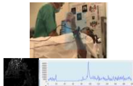
Figure 1: Top: Scene with the chosen analysis window (blue); bottom left: vector field between two frames at a specific moment; bottom right: optical flow [arbitrary units] over time [s]

Data analysis: Synchronisation between video and acceleration data had to be performed manually. They were both grouped according to stimulation amplitudes. Interesting sequences were extracted from the video and software was developed to analyse the movement of the arm within a chosen region of interest (ROI) based on the Lucas-Kanade algorithm [4] implemented in Java (JavaCV using OpenCV 2.4.2): a vector field was calculated for the ROI based on the highest probability of movement of a 5x5 mask from one frame to the next (Fig. 1).