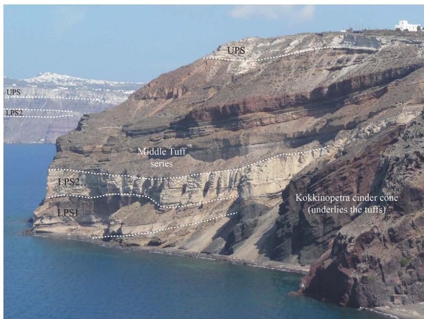
Figure 2. The cliffs of southern Thera island (Cape Loumaravi). The LPS2 is clearly not the same layer as the UPS plastered lower down the cliff surface, as proposed in [1]. It is a much older unit. Tuffs of the intervening Middle Tuff series clearly overlie the LPS2; this is especially clear at the headland, and indeed at innumerable three-dimensional outcrops all around southern Santorini. The apparent offset of the base of the LPS2 in the middle right of the photograph is due to perspective effects, not faulting.

excavation site because it is deeply buried at that location, below the tuffs of the Middle Tuff series that underlie the UPS. The only evidence provided in [1] to support the authors' statements referring to "archaeological evidence of Cycladic objects at several localities under the so-called LPS" is anecdotal. The claimed discovery of a Cycladic house some way down the caldera cliff at Balos is very interesting. If confirmed by detailed archaeological excavation, it would indeed show that that part of that cliff already existed prior to the LBA eruption. However, it does not in any way bear on the origin and age of the LPS.