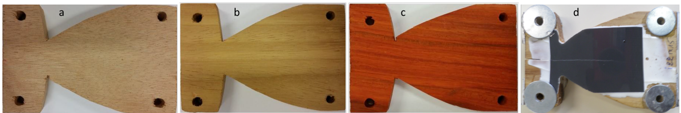
Figure 1. Wooden specimens: Okume (a), Iroko (b), Padouk (c) and the specimen Iroko equipped grid (d).

Typical MMCG specimens made of each of the three different species are shown in Figure 1. The main difference between the three species is their density: Okume (density = 0.44) is less dense than Iroko (density = 0.64) and Padouk (density = 0.79). For all the specimens, the initial crack length is the same: a=20 mm. It is located at mid-height and oriented along the fiber direction, which is horizontal here. The initial crack is completed by a notch (length: 2 mm) made with a cutter in order to initiate correctly crack propagation. A grid, with a regular pitch of 200 microns, was transferred on one face of the specimens, see Figure 1 (d). The technique presented in [4] is used for this purpose.